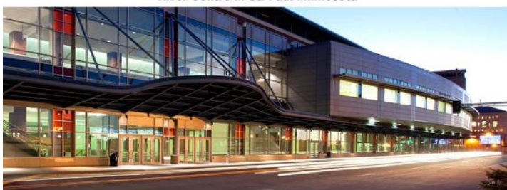
River Centre in St. Paul Minnesota