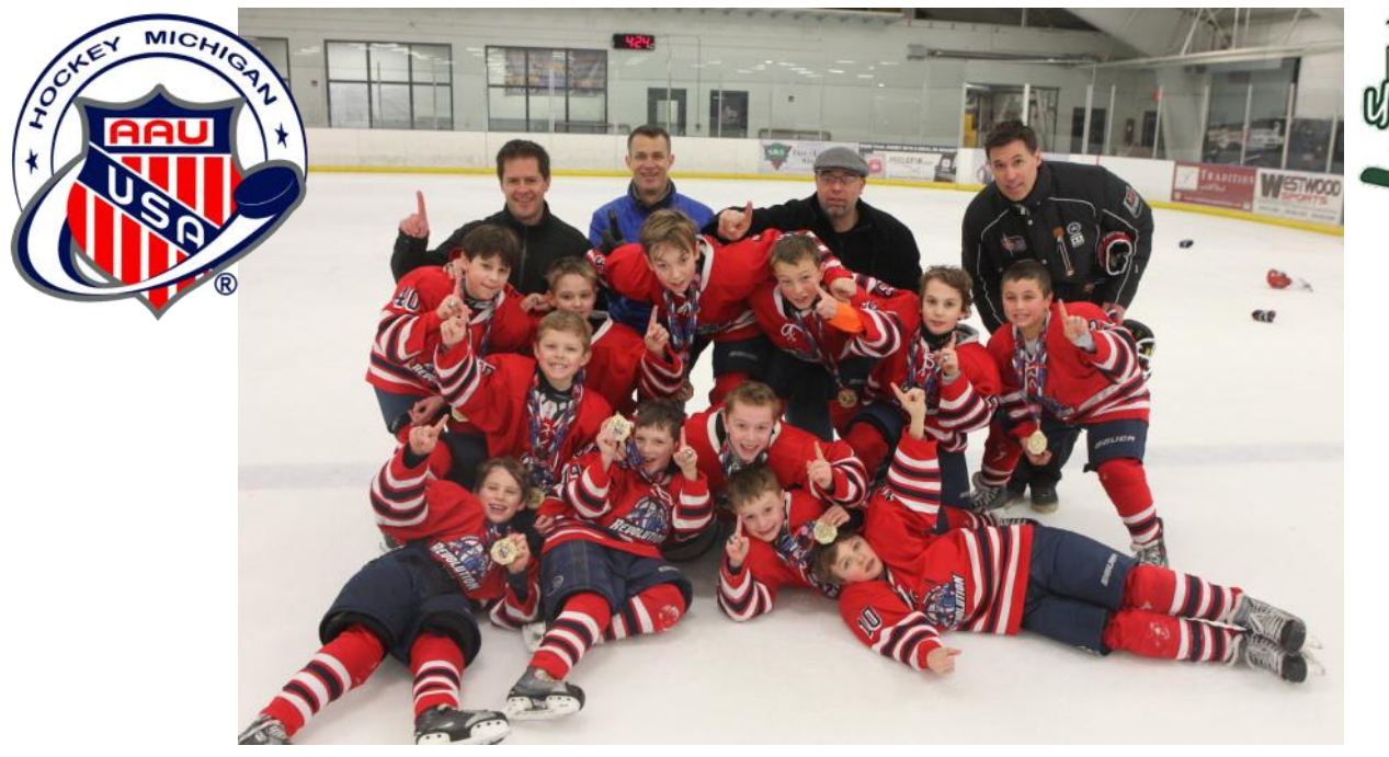
8U AA - Gold Medalist - DSC Revolution

8U AAA - Gold Medalist - Illinois Steel Champions of: Hockey Illinois League and Motown Showcase