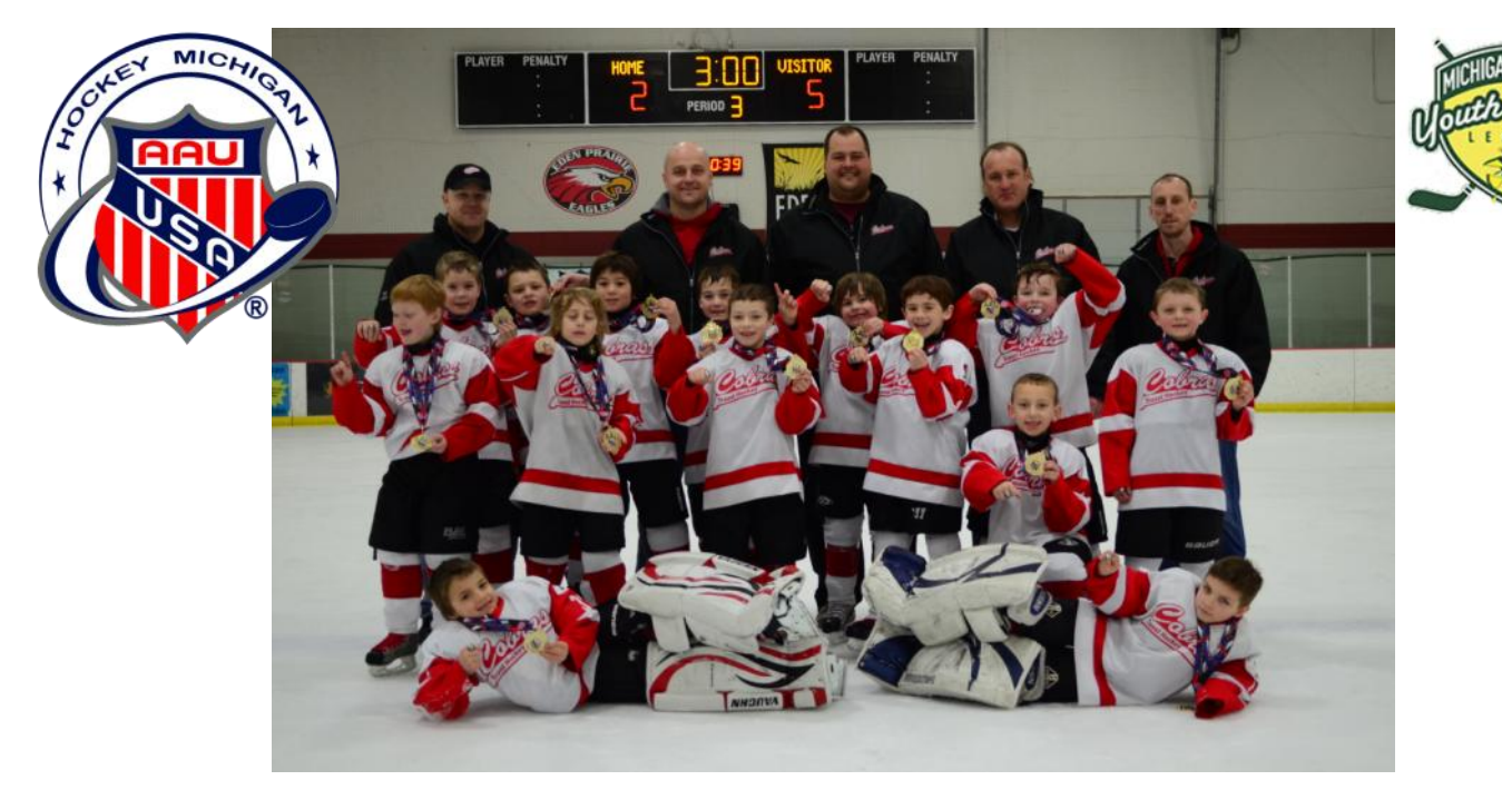
8U A (Tier 2) - Gold Medalist - Dearborn Cobra Selects Champions of: League (MAYHL 7U Advanced), Glacier Pointe Early Bird, Cleveland Mite Showcase

8U A (Tier 1) - Gold Medalist - Florida Fire Ants