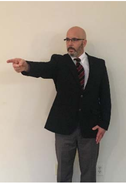
Jogai Hansoku Chui