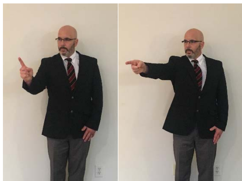
Mubobi Hansoku Chui