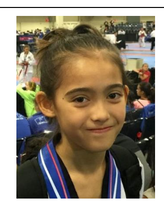
National Experience: 2015 AAU Taekwondo Medal – Gold