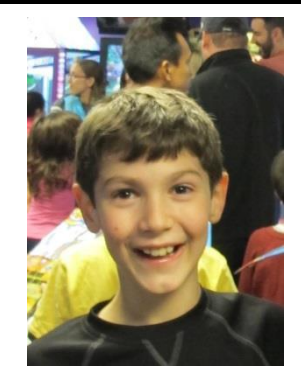
National Experience: 2015 AAU Taekwondo Medal – Gold

Bio: I am 10 years old and attend Beltsville Academy. I am in the 5<sup>th</sup> grade. I started Taekwondo when I was three years old. I enjoy doing Taekwondo and would one day like to go to the Olympics. My hobbies beside Taekwondo include playing the violin and drawing.