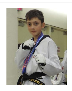
National Experience: 2015 AAU Taekwondo Medal - Gold