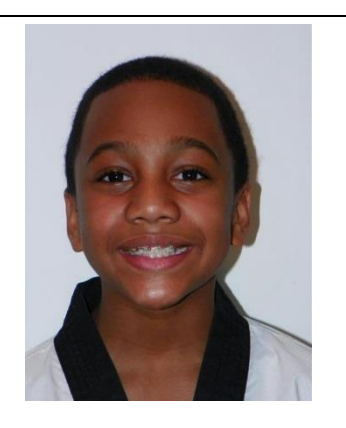
National Experience: 2015 AAU Taekwondo Medal – Gold