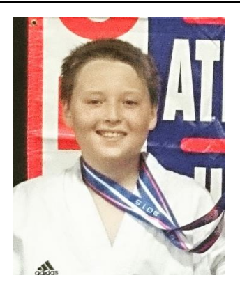
National Experience: 2015 AAU Taekwondo Medal – Gold 2014 AAU Taekwondo 2013 AAU Taekwondo Medal – Gold