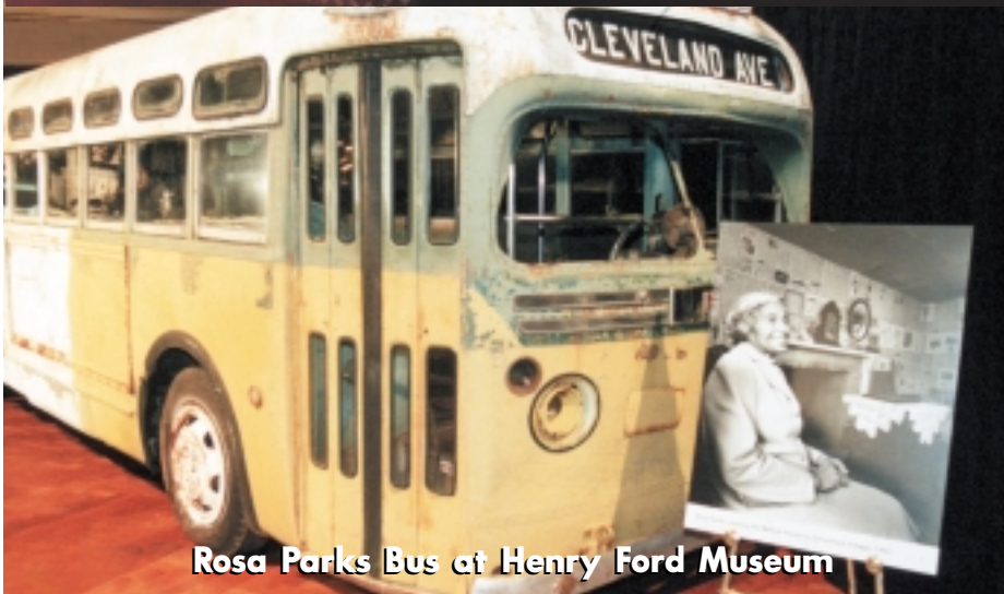
Rosa Parks Bus at Henry Ford Museum