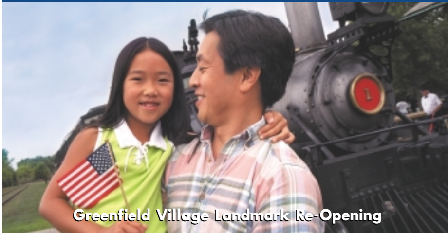
Greenfield Village Landmark Re-Opening