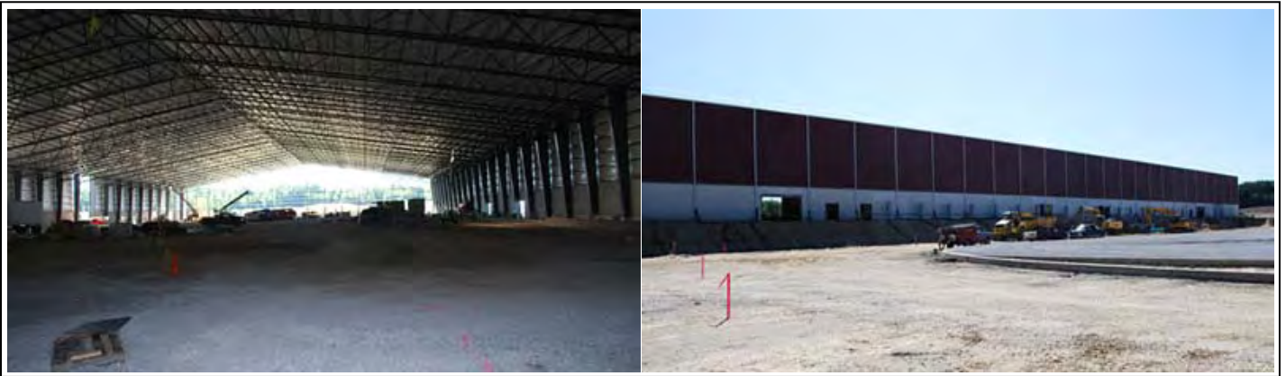
Track Building construction – taken September 3, 2009