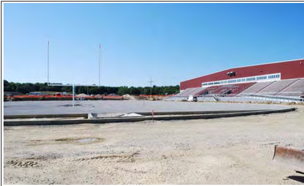
Stadium construction – taken September 3, 2009

The stadium will be strategically located between the Fields and Courts Building and the Indoor Track Building to provide enclosed and climate controlled seating on both the east and west stands. The stadium will feature a total of 5,500 seats, including 1,200 captain's chairs and loge boxes. The west side of the stadium will house the press box which will be constructed as a dual use space for both the Stadium and the Fields and Courts Building. The public stadium will accommodate a variety of local, state, regional and national events.