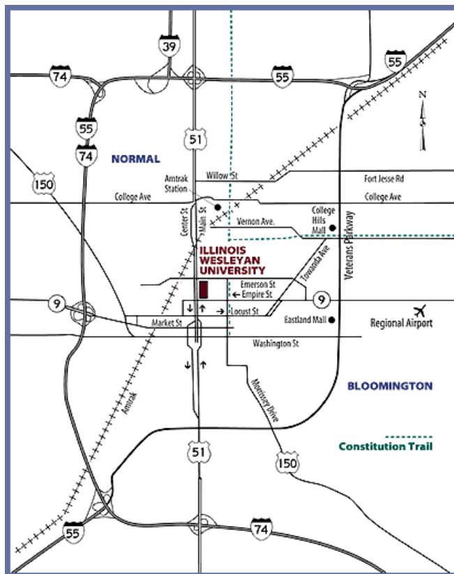
Bloomington City Map